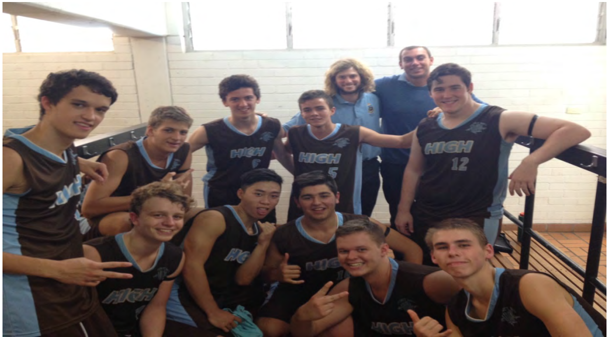
SBHS defeats TSC @ TSC 2014 and 2015. SBHS; Top 3 sides in the Nation 5 years in a row!!

Sydney Boys Basketball is back! Hope everyone enjoyed the break and put some shots up over the holidays. To all newcomers, hope you are having a great time at High. First game of 2015 went well. 1 st and 2 nd grade triumphed over their opponents. All 15s teams also won their matches, which is great to see. Two consecutive draws in 16s (Cs and Ds) was interesting. The win percentage this week was around 47%. Sydney High Basketball has one of the highest standards in win percentage. This means that EVERY TEAM COUNTS. Whether you're in As or Fs, you have to push yourself on that court. Whilst saying that, enjoy yourselves in the most fun sport going around!!!!