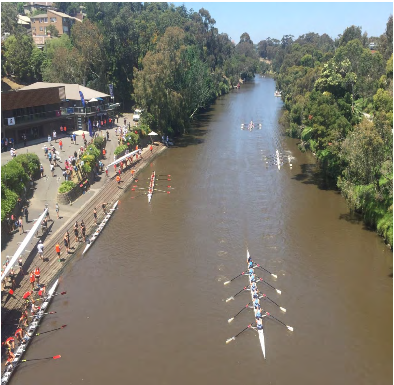
SBHS Y10 Eight in Head of the Yarra