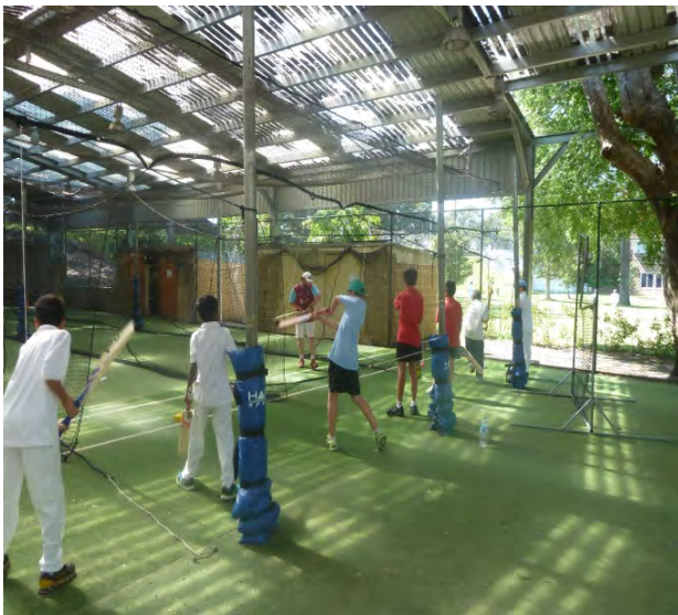
U14 development squad practising their straight drive

Part of increasing participation, improving our skills and enjoying the game we have decided to create an U14s development squad. Here the boys will learn the basic elements of the game that incorporates breaking down the skill and then moving into fun and active modified games. The boys learnt the art of a forward defence and throwing. Next week we will focus more on fielding and some bowling.