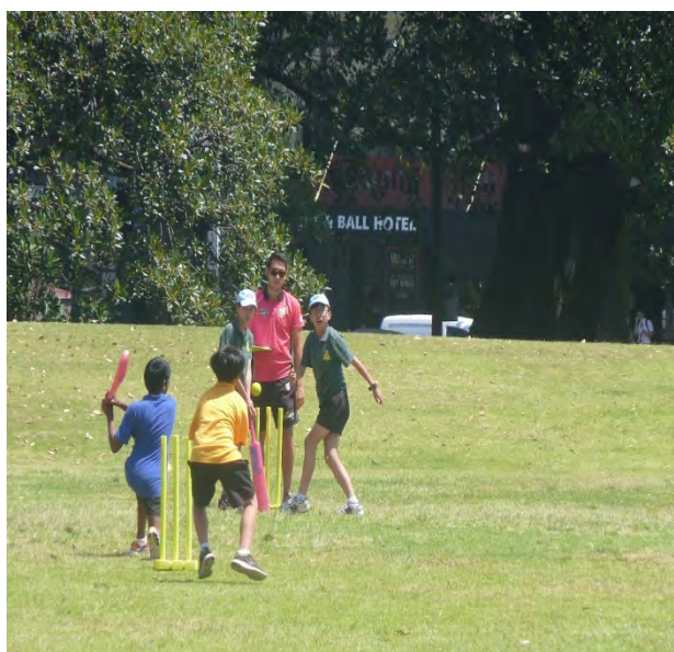
U14s and U15s playing in the Milo T20 Blast

During the week we had Cricket NSW come out and host a Milo T20 Blast competition between our U14s and U15s team. The boys thoroughly enjoyed their time and it was a great way to mingle with other players.