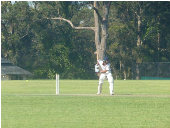
1 st XI, Vishal Nomula, setting up for a cover drive

become predictable and allows the batter to find a rhythm. Shore batted well and managed to find the gaps when needed and won with 8 balls remaining. The final match against Riverview was going to be a close encounter with both teams without a win. Riverview batted first and posted a total that was definitely gettable. Raphin opened the batting and scored a captain's knock of 45, but the lack of consistency with players caused another collapse which ultimately halted our run scoring falling short again.