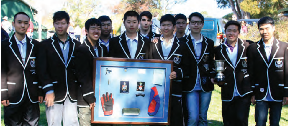
Sydney High were placed first and second in the All Schools Match held in July taking out the Fiona Reynolds Shield.