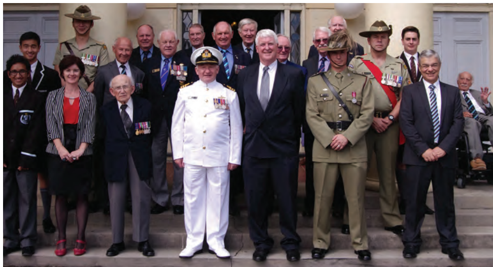
Our distinguished guests at the Anzac Day Assembly.