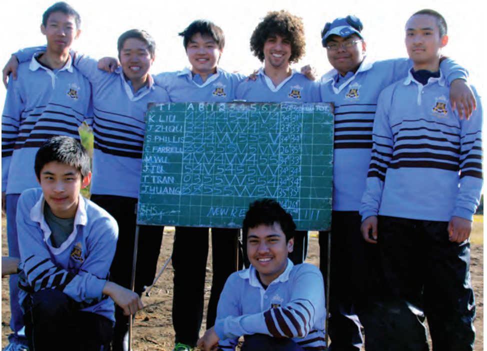
The Sydney High Second Grade Team showing off their scoreboard after taking out the GPS Second Grade GPS Competition.