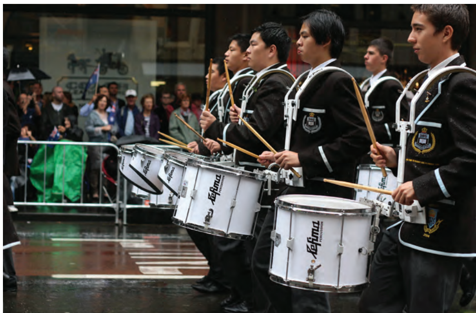
The Marching Band at a rainy Anzac Day march.