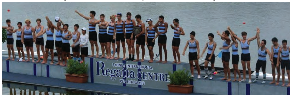
SHS Eights on the CHS Championships podium.