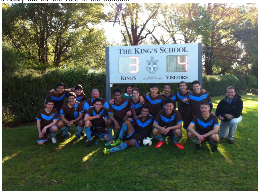
The 1 st XI boys celebrating their victory against King's