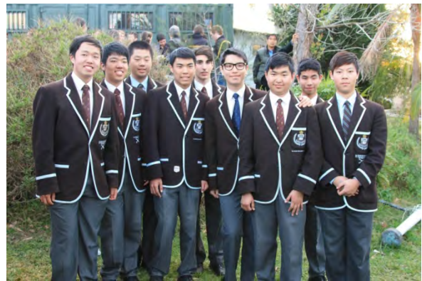
1 st Grade 2014