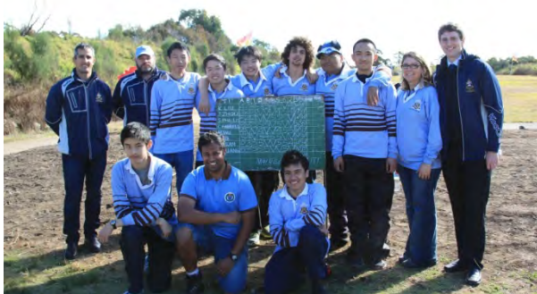
2 nd Grade Premiers 2014