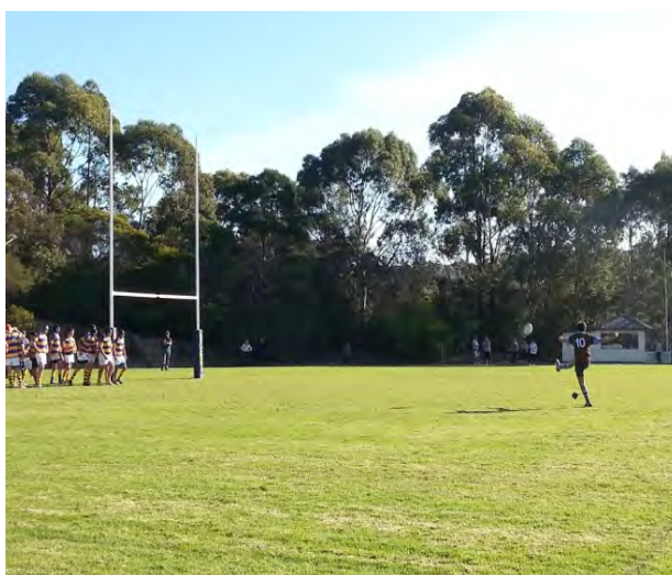
Mitchell Flynn converting one of the many tries scored by 1 st XV