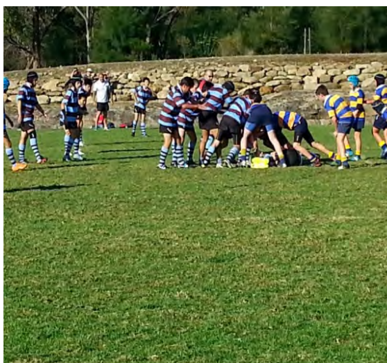
13s in their first Rugby game.

The first game proved a very positive start for our senior teams with both 1 st and 2 nd XV gaining victories over St.Pius X 2 nd and 3 rd XV respectively. All junior teams had their first hit out against strong opposition and showed some promising signs for the season ahead.