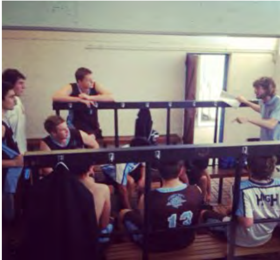
Image taken after High defeated Scots at Scots on the 12 th of October 2013. ‘Mateship’