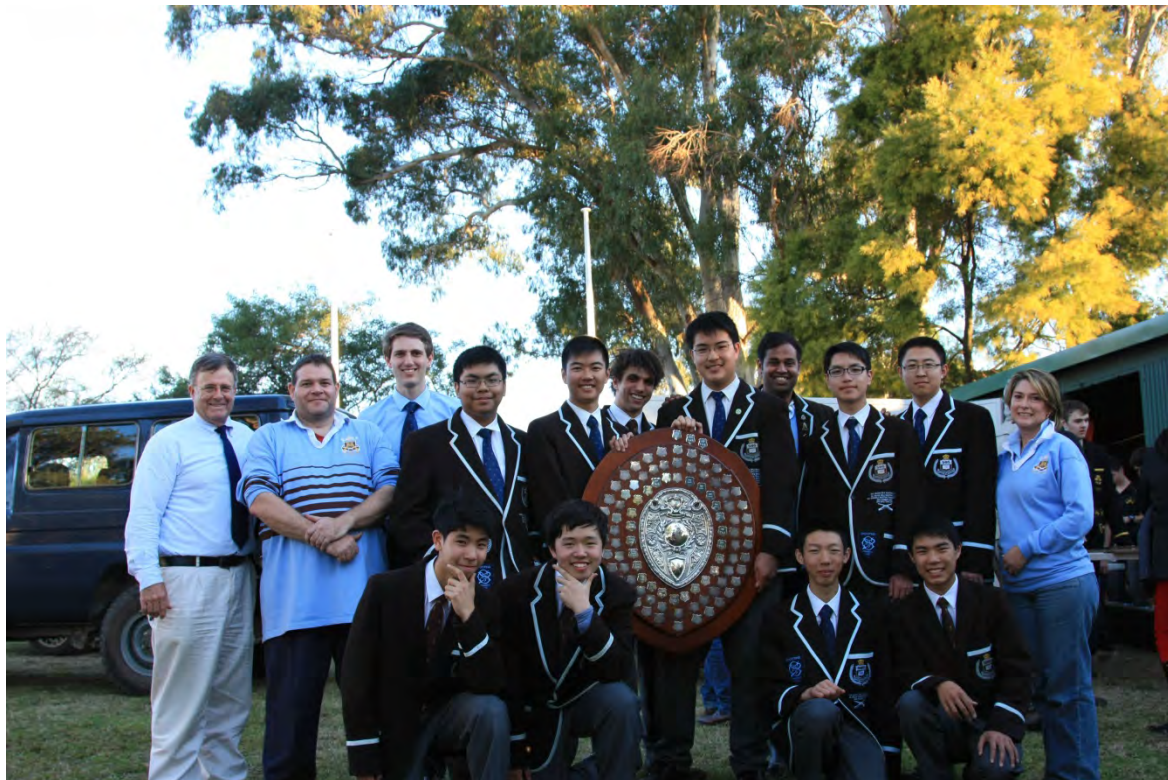
1 st Grade Rifle Team with the Buchanan Shield