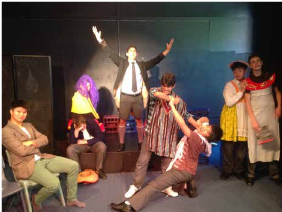
Year 11 Drama Students