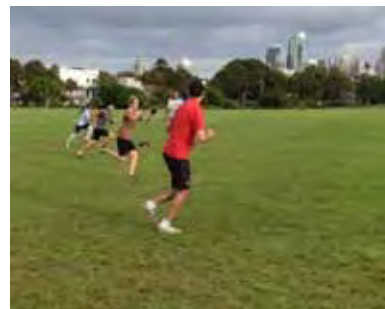
Training program for Rugby 2012