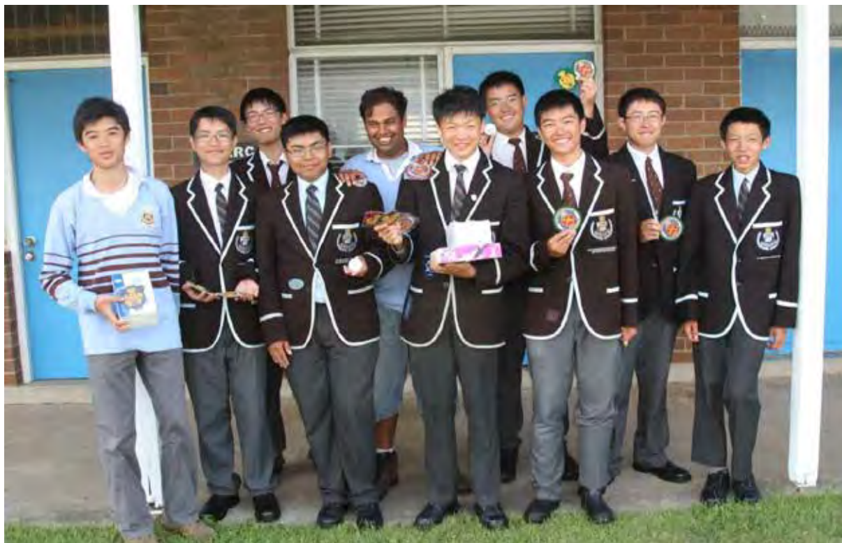
Sydney High Team after the NSW Queens Prize Shoot