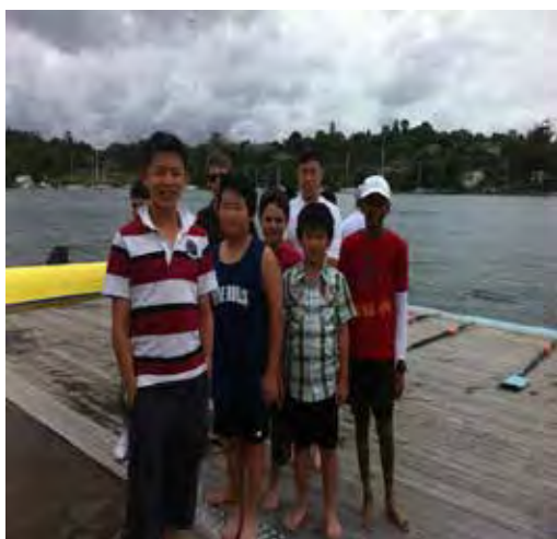
New students for 2012 try rowing

Thank you to the Rowing Committee parents for organising a delicious breakfast menu, enjoyed by all under the marquee by the river and thank you to the parents who contributed to the hamper raffle. We welcomed some of our new intake students and it was great to see them have a try at rowing, along with many parents interested in having a go!