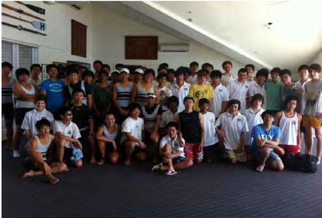
Melbourne High and Sydney High crews at the High Rowing Sheds