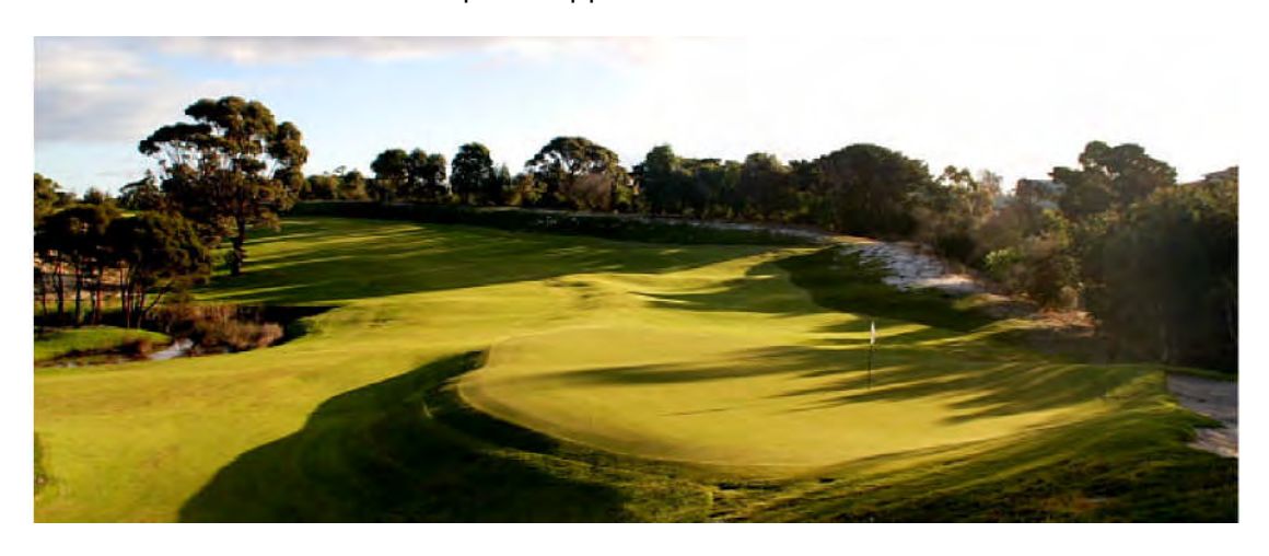
Page 2 - Driving Instructions / Dress Regulations