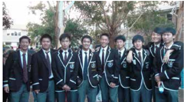
Years 11 and 12