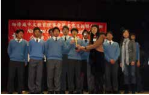
Years 9 and 10

The 22 nd National Chinese Eisteddfod was held on Saturday, 21 May 2011 for Cantonese and non-native Mandarin speakers, and on Saturday, 28 May 2011 for native Chinese speakers at Strathfield Girls High. Selected students across all Years participated in the competition, a nationwide event for Chinese language students in Australia, organised by the Chinese Language Education Council NSW with Chinese newspaper Sing Tao Daily .