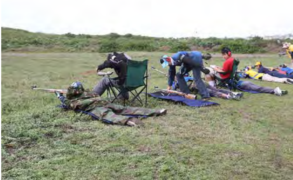
Fullbore Competition against Scots