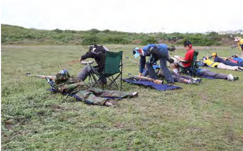
Fullbore Competition against Scots