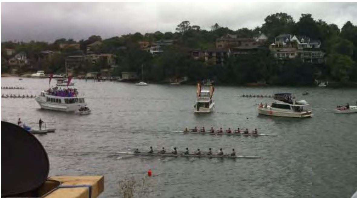
High2 nd Eight race Joeys to the finish line