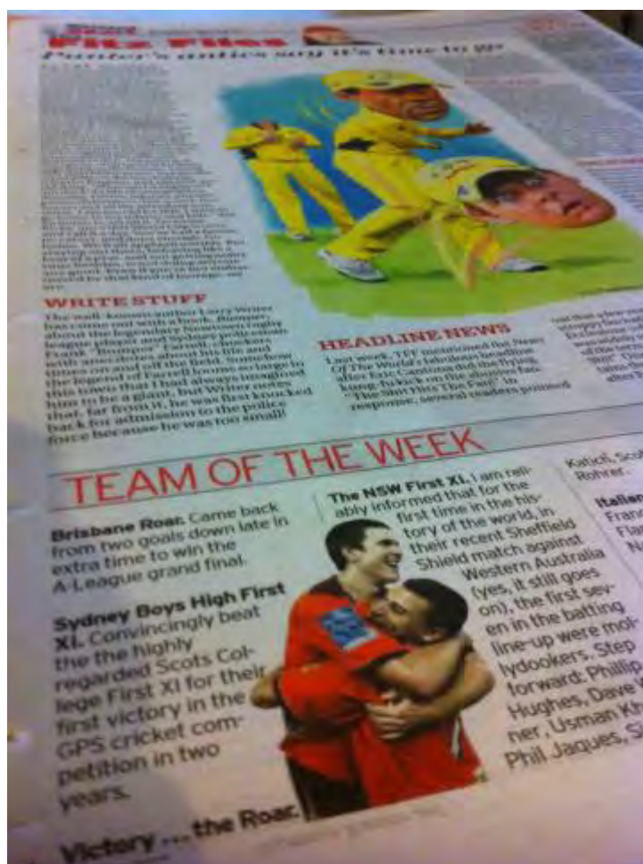
Picture/article The Sydney High 1 st XI were team of the week in the Sydney Morning Herald judged by Peter Fitzsimmons.