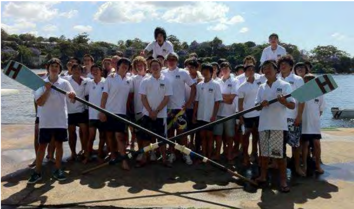
Melbourne High and Sydney High crews at the High Rowing Sheds after the Head of the Parramatta