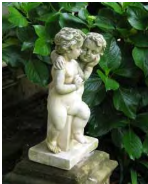
The statues of 'Dianna', 'The Musicians' & 'The Twins' are located in the courtyard.