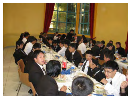
Dinner at Peronne