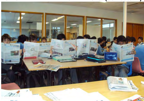
Yr 10 Commerce Class Waiting For Teacher.

Another year another dollar! Over 300 hundred students participated in the Game with Yr 10 students filling the top ten places in the SBHS rankings. It was pleasing to see Yr 7 students participating for the first time and holding their own in comparison to the senior students.