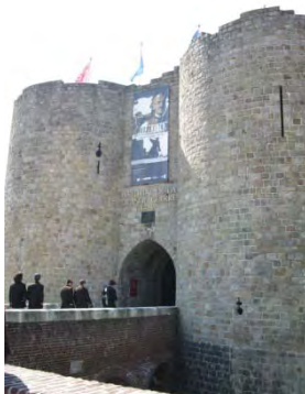
Historial De La Grande Guerre 14-18