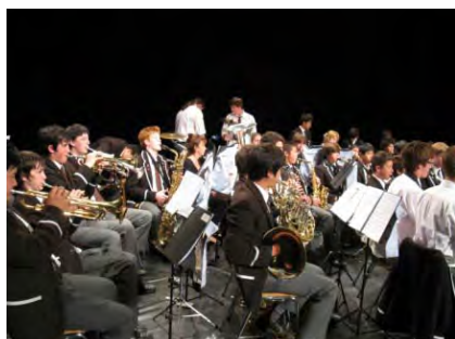
Rehearsal at Espace Mac Orlan, Peronne