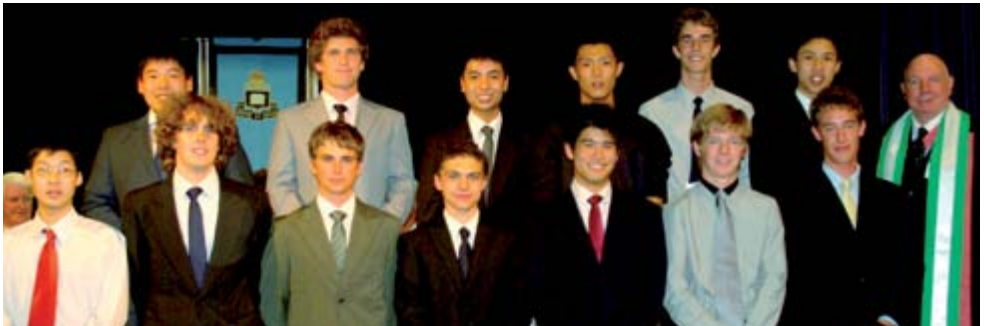
The Director General Award recipients:

John Pilger [1957] delivered the Occasional Address at this year's Presentation Night. An edited version of his speech was printed in the Herald and can be read at http://www.sydneyboyshigh.com/speeches/speech-night-2010-occasional