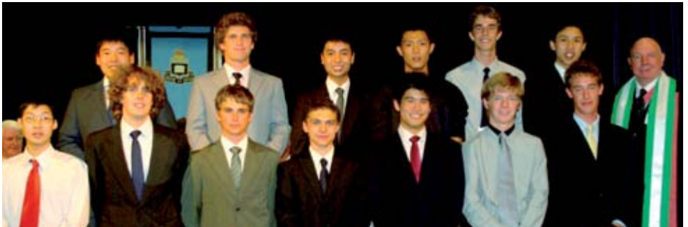
The Director General Award recipients:

John Pilger [1957] delivered the Occasional Address at this year's Presentation Night. An edited version of his speech was printed in the Herald and can be read at http://www.sydneyboyshigh.com/speeches/speech-night-2010-occasional