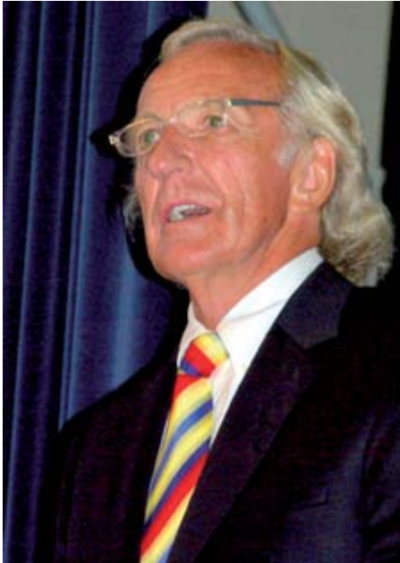
John Pilger - guest speaker