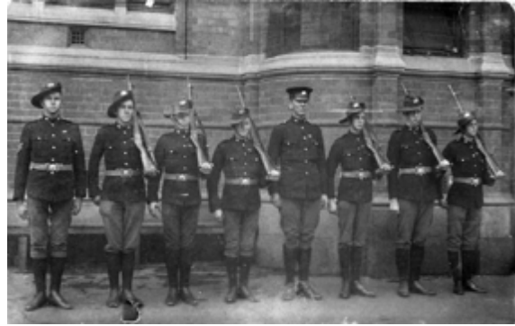
The Sydney High School contingent that went to the coronation of King George V, in 1911

As part of a comprehensive system of land defence, the Commonwealth Government has founded at Yass-Canberra a Military College for the training of officers. The SHS has already sent thither its quota of boys, and it is to be hoped that she will ever continue to do so. A splendid training and a fine profession are being thrown open to aspiring youths at no cost to themselves.