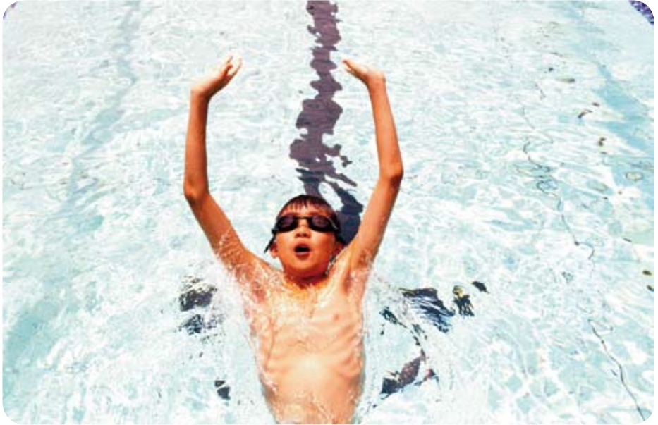
A year 7 boy launches off for the backstroke at the swimming carnival.