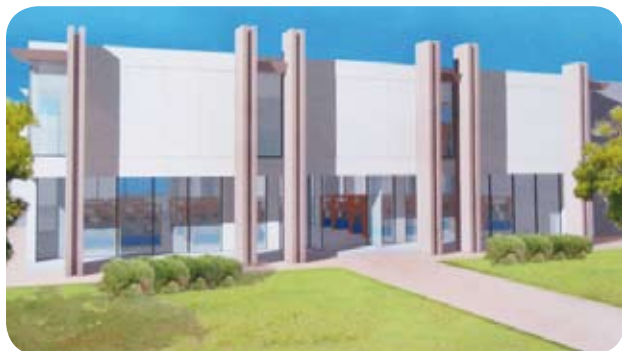
One artist's impression of the future library.

Now is the time to give it your support too!