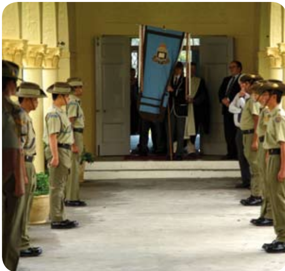
The cadet unit provides a guard for the official party as it proceeds to the Great Hall.