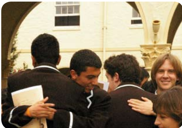
The class of 2006 celebrate after graduating from Sydney High.

Thirty-one boys received Premier's Awards for scoring 90 or higher in 10 units of study