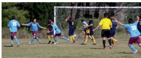
The 1st XI celebrating a goal against The Scots College at McKay.