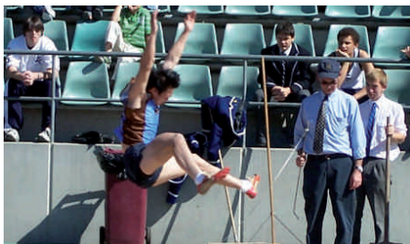
A long jumper bracing himself for landing during the GPS Carnival.