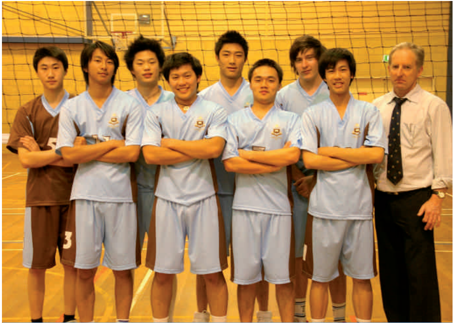
The 2007 NSW and GPS Volleyball Champions in the school gym.