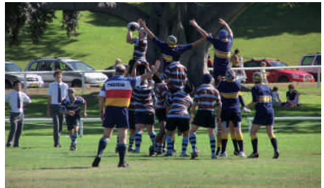
High's 16A XV dominating a lineout on McKay One, High Rugby's home.