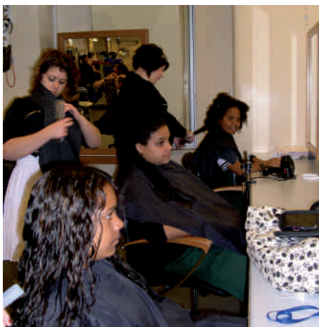
Girls from 'Bogga' experiencing classes at Ultimo TAFE.