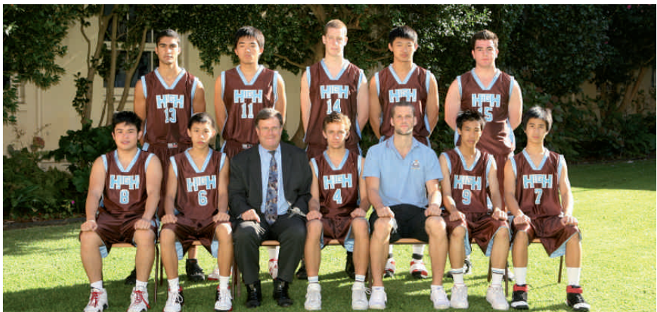
High's 1st Grade Basketball Team ranked third in NSW at the CHS Tournament, defeating several elite sport high schools on the day.