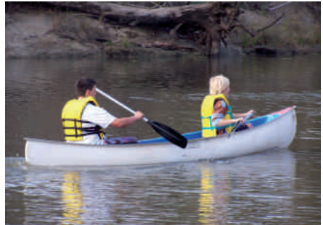
High boys canoe with Bogga kids on the NSW-Queensland border.

never swum in the ocean, visited a shopping centre or seen a State of Origin game with 80,000 other rugby league fans before coming to Sydney. More importantly, few of