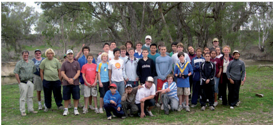
The 2007 contingents from Boggabilla Central School and Sydney High assembled in the bush.

them have the opportunity to visit a university or TAFE or to develop the close bonds with city kids that come from a reciprocal billet arrangement held over a number of years.