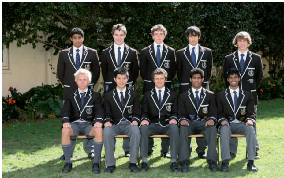
The CHS and GPS representatives assembled in the School's quadrangle.

Sydney High is unique because its boys may be selected in either GPS or CHS representative teams. In 2007, 11 boys received representative honours.