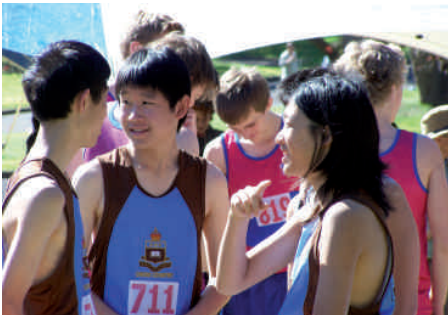
Three High cross country runners relax before the endurance event.