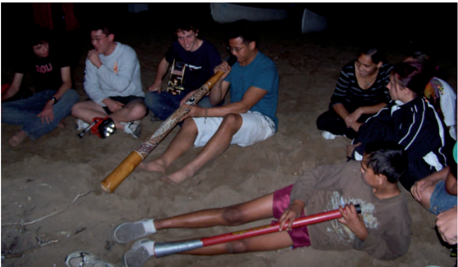
The boys from High camp with the Bogga kids, learning Aboriginal customs.