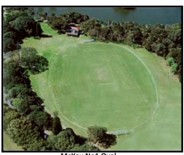
McKay No1 Oval