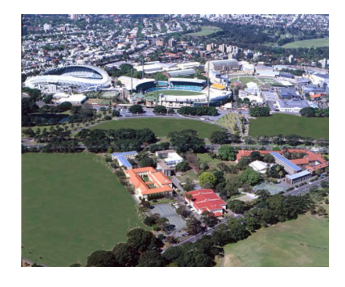
Aerial view of Sydney Boys High School

Partnerships among staff, students, parents, old boys and supporters of High are indispensable in the operation of the school.