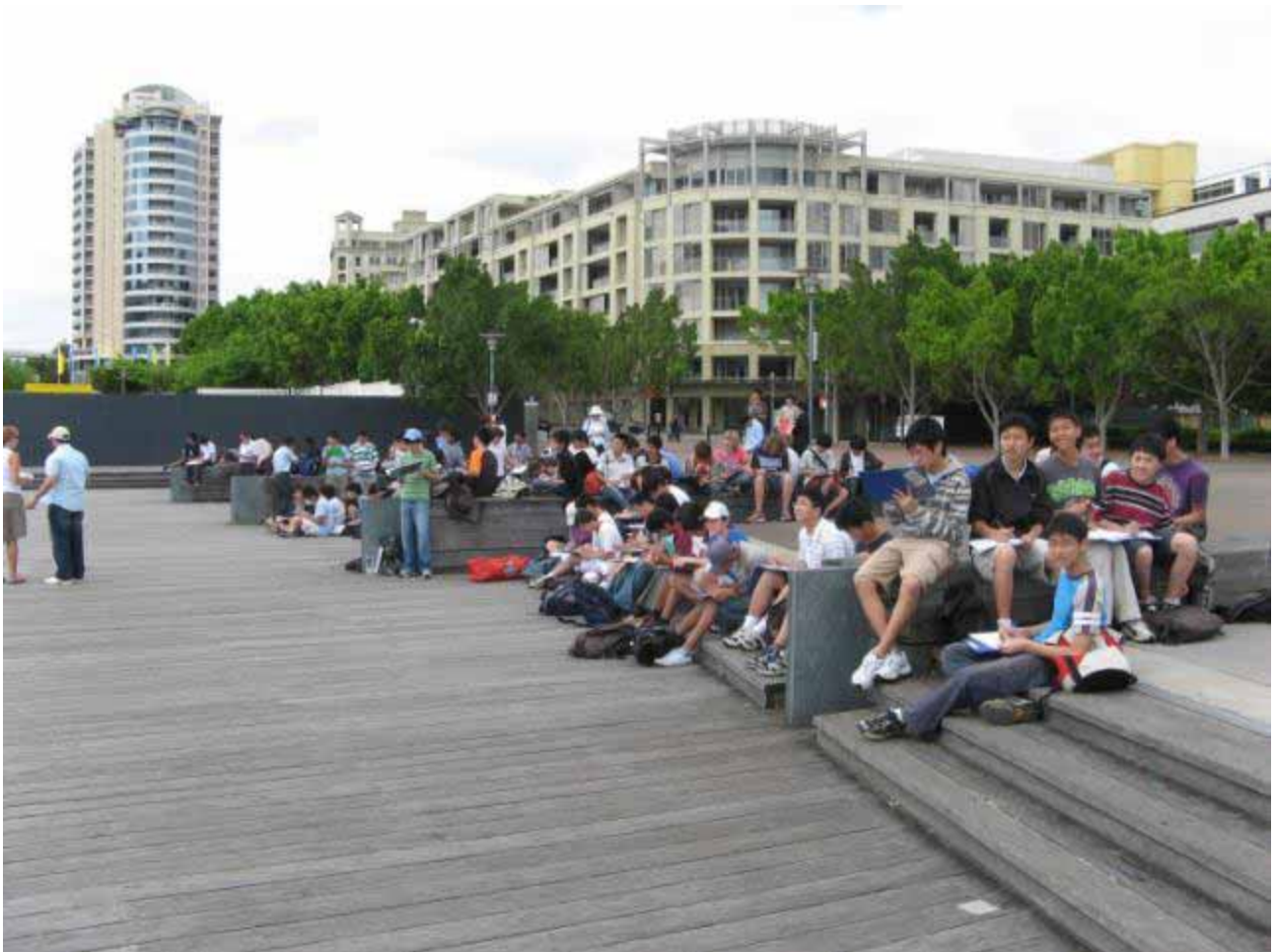
P Ganderton Social Science

An excellent day's work from a very dedicated group of students with very pleasant weather (not our norm!) to complete the experience.