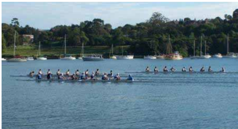
Old Boys Race against school 1 st & 2 nd VIII

There are a few minor changes to the calendar. They are the GPS sculling Day which is now on November 28 after school at Penrith. This involves only our top 4 scullers. Also the CHS Championships are now on Tuesday March 31 and Wednesday April 1 at Grafton. These are age championships so the top rowers from each group will attend.