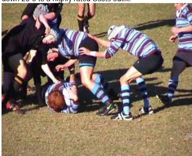
Play against Sydney Grammar from 2003

Wet weather led to the unfortunate cancellations of many games on Saturday, taking away a much wanted match up before the big hit-outs this week. However, the High 13As and Bs played games, both teams going down by around 30 points. The 14Bs and 14As also had their games: the Bs notched up a tight 17-15 win, whilst the 14As couldn't use their backs to their ability due to the wet weather. The 16As yet again continued solid form, going down 26-5 to a highly rated Scots outfit.