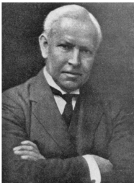
Sir Grafton Elliot Smith (1871-1937) The most famous Old Boy of his generation.