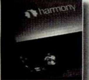
For further details about the Student Film Festival, see the Visual Arts Department – www.harmonyfilmfestival.com