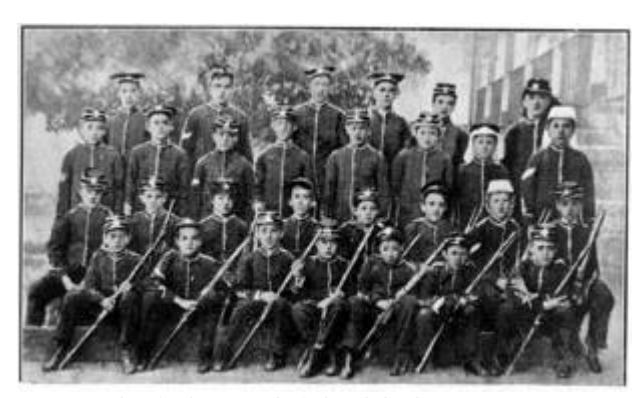
The Sydney High School Cadets, 1884.

The unit maintained a separate and continuous identity until 1913 when all school cadet activities were subsumed into the Commonwealth government's compulsory military training program. All eligible members were a part of the Citizens' Forces until compulsory military training was abolished in 1929.