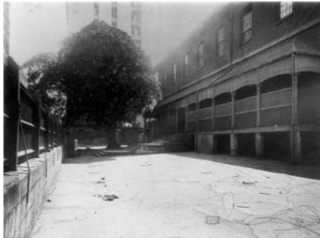
The Castlereagh Street playground, c 1920, shortly before the demolition of the building. The area in the foreground was most likely the space dedicated to the School's first tennis court.

Nothing is heard of tennis again in the annals of the School until the re-establishment of the tennis club in 1899.