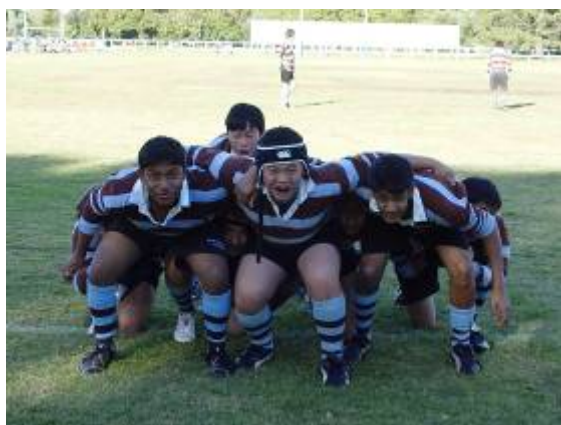
practicing at Rugby Kick-Off Day