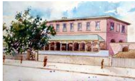
The old school building in Castlereagh Street was not an ideal teaching environment.