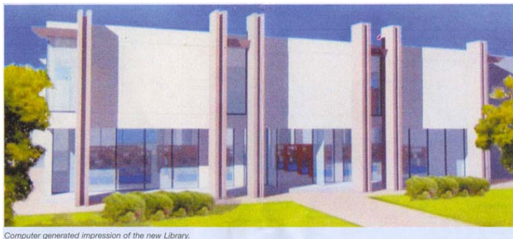
Computer generated impression of the new Library.

Sydney Boys High School depends upon its community of parents, Old Boys and supporters to further the School's ethos of the pursuit of all-round excellence.