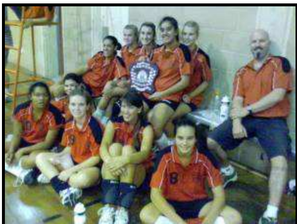
The winning team at the girls tournament – Sydney North

The first round of GPS Volleyball kicks off this weekend with High playing Scots at Scots.