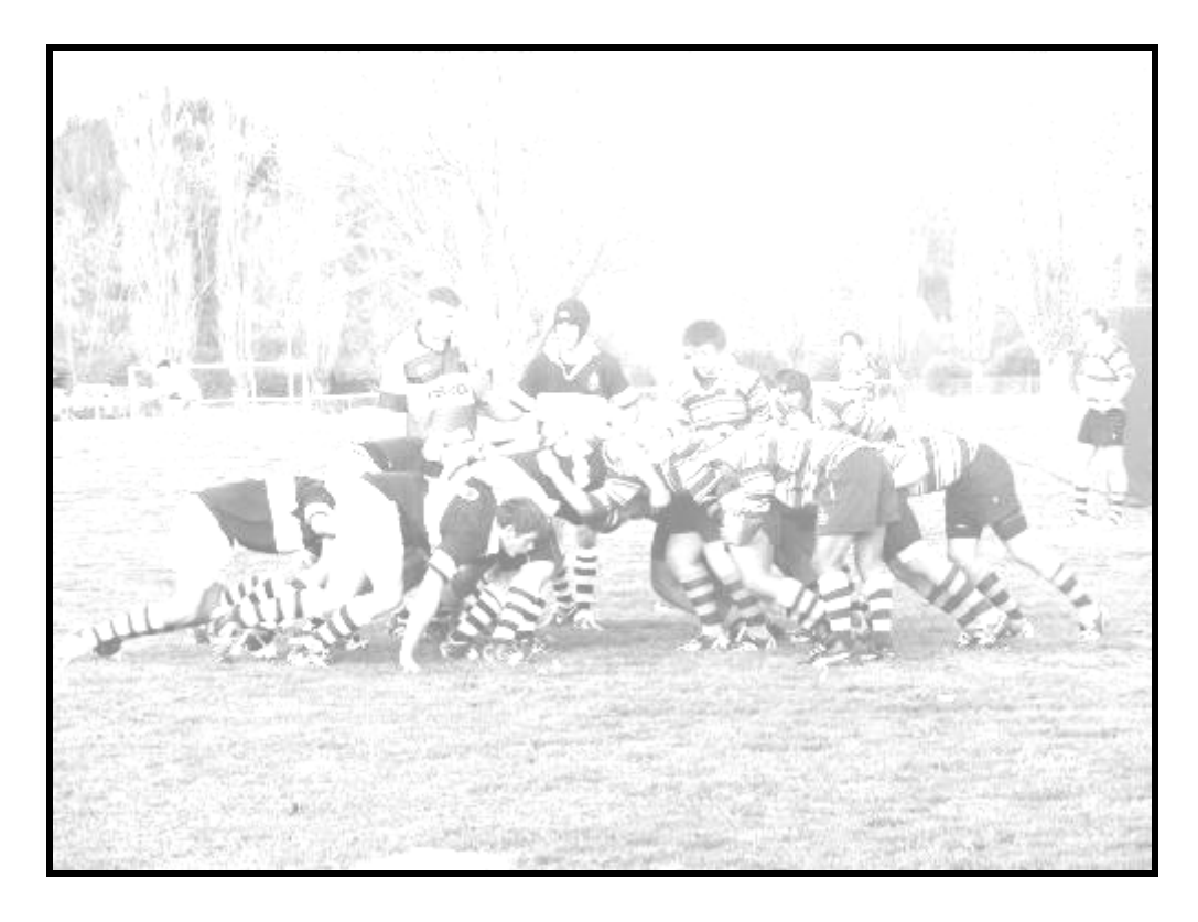
First Fifteen scrum at Armindale