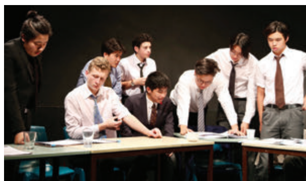
Performance of 12 Angry Men