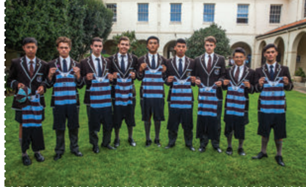
2018 1st VIII receiving their competition zoot suits for the Head of the River