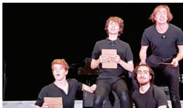
2017 Year 12 group performance