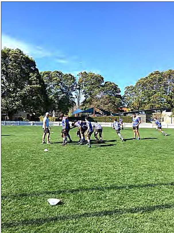
1 st XV warm up