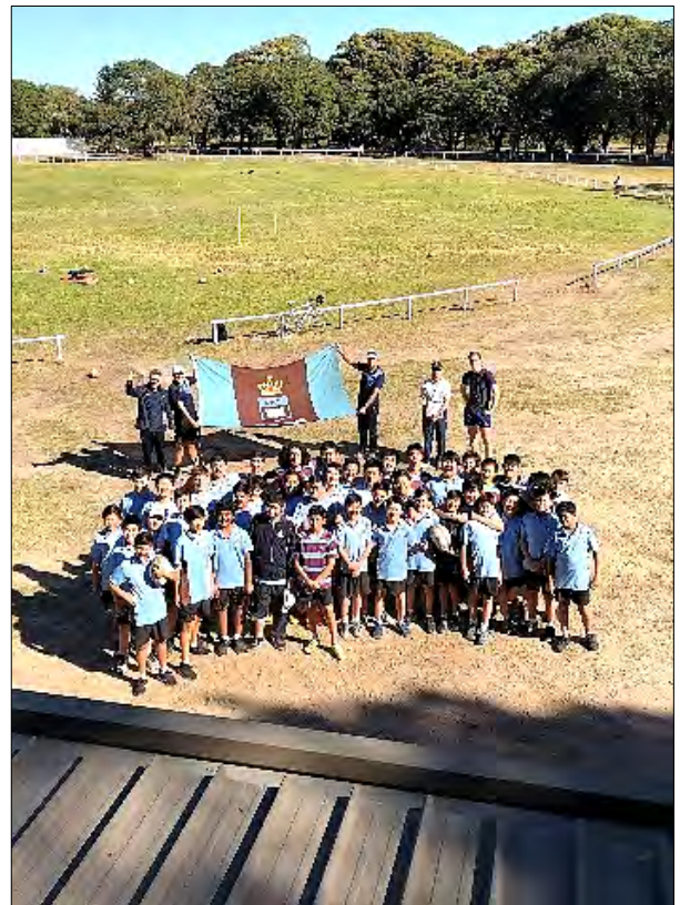
All our Juniors at McKay