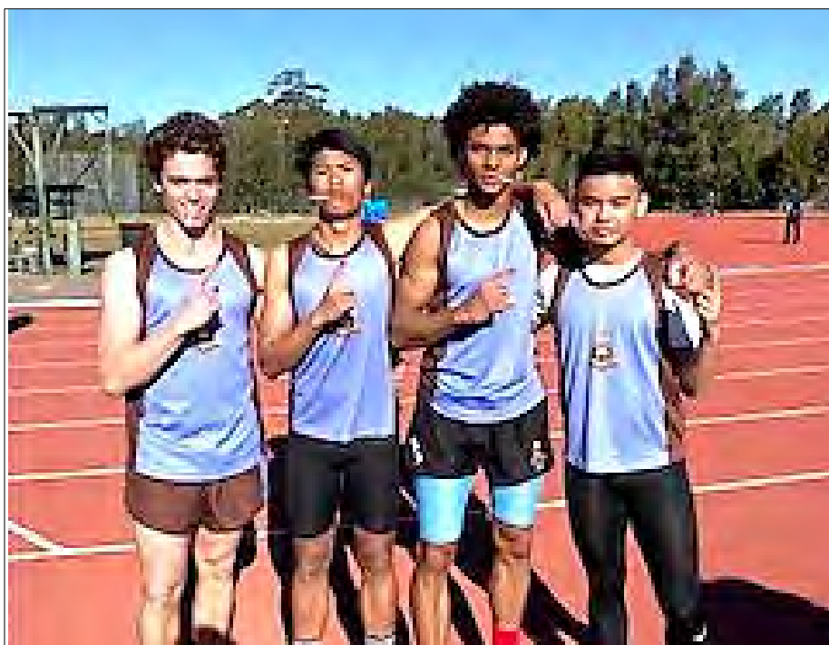
17+ Relay Team