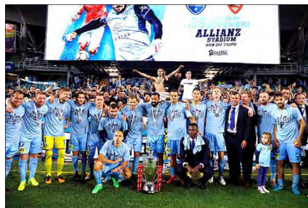
FFA Cup 2017 Winners Sydney FC