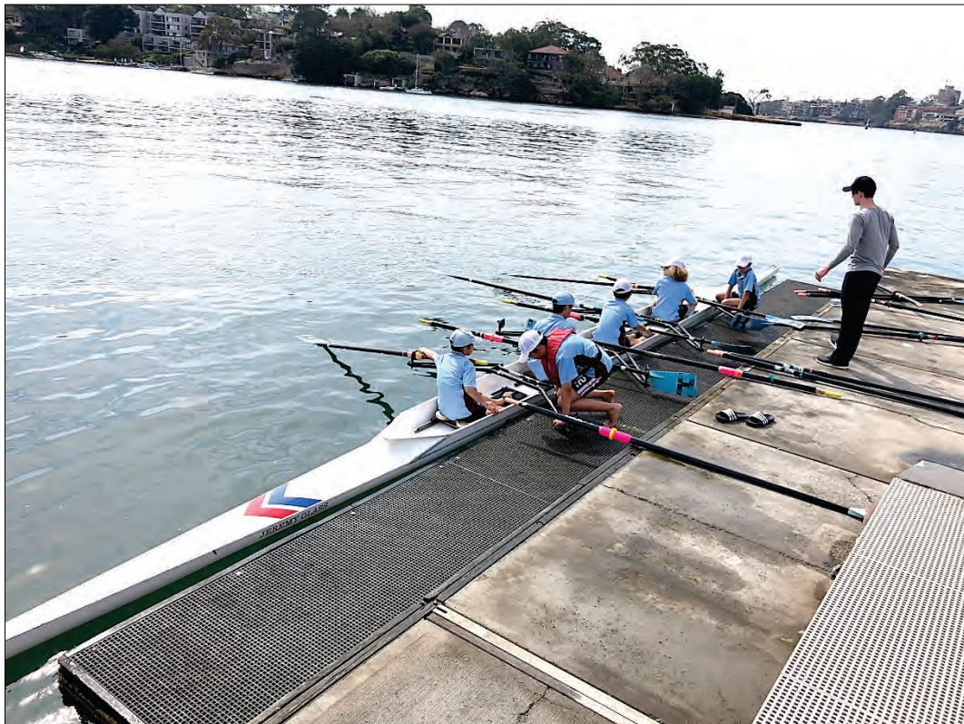
Year 8 Quads learning how to exit the pontoon safely