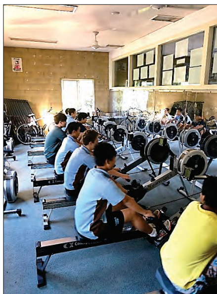
Year 10 VIII's hard at work on the rowing machines at school