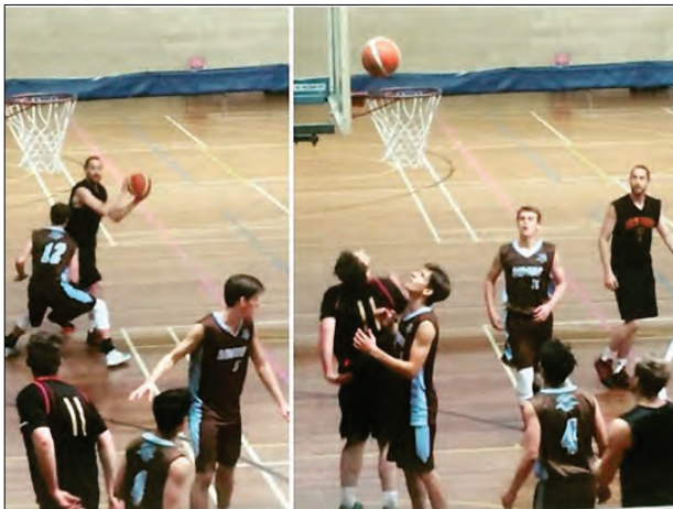
Old Boy v School Game 2017

Welcome to another edition of Shootin' Hoops. Not too much has changed since last week, so it will be short and punchy. Just make sure to keep practising for the upcoming season.