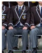
The High Store

This day is allocated to current students entering Year 8, Year 9, Year 10, Year 11 and Year 12 in 2016 ONLY.