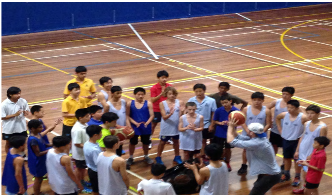
Pic of 'FUTURE FIRSTS' TRAINING

Other than that, wishing everyone a good week leading up to the game against Grammar. Go High!