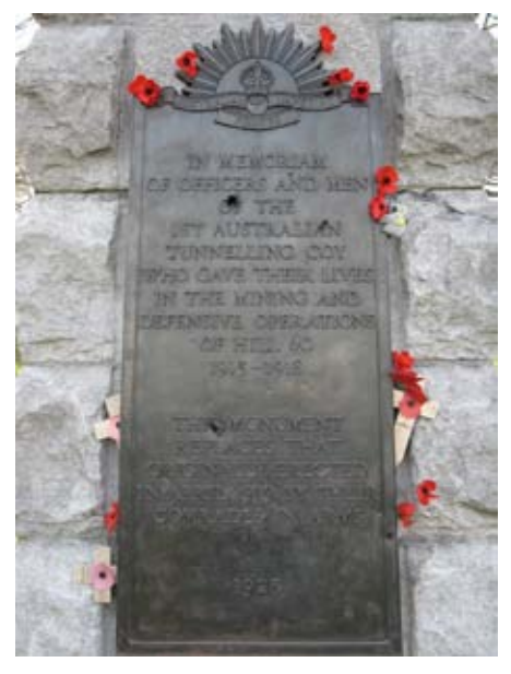
SYDNEY BOYS HIGH SCHOOL ANZAC FRANCE AND FLANDERS TOUR 2010