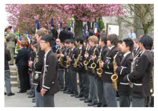
Bullecourt, Anzac Day, 2010