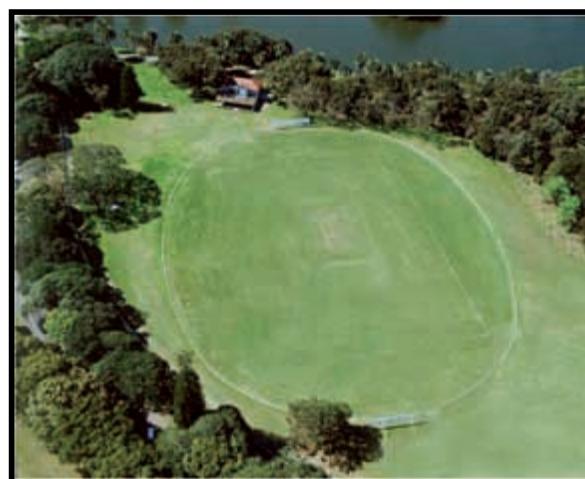
McKay No1 Oval