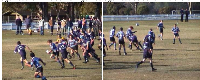
Memories: Vs. Shore 2003

Maybe not every team managed to "shock" the boys from the North, but some teams really stepped up a level this week putting the pressure on Shore. Notably the 16Bs recorded their first win of the GPS season along with the 13Ds with their first win of the year. The big highlight however was the 16As who followed through with the performance of the year so far, going down 12-0 to a Shore 16As side which last year piled on over 60 points against them. Aside from games against traditional rivals Grammar, I cannot recall an As team coming this