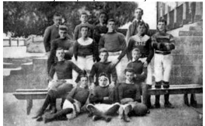
The first Sydney High School Rugby team, 1884.