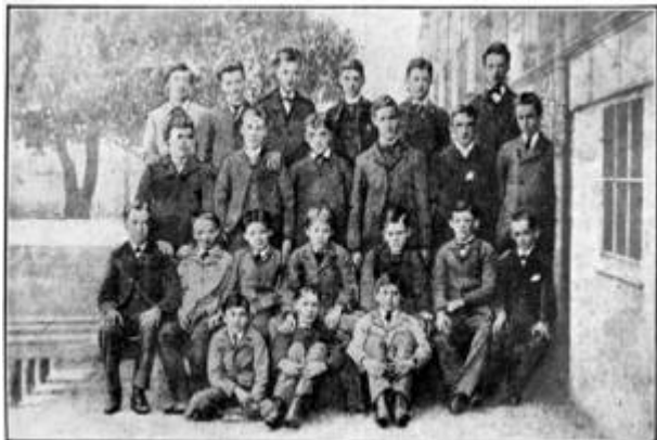
The Senior Form of Sydney High School, 1884.

On an unofficial level, there was a nearby dancing school that pupils from each school attended and the girls occasionally put on a dance to which they could invite any relatives they had amongst the boys. The word "relative" was very loosely construed as a large proportion of the boys were present on these occasions, although it should be noted that the dances were conducted "under the supervision of many formidable chaperones".